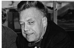
DR. ALFRED KINSEY